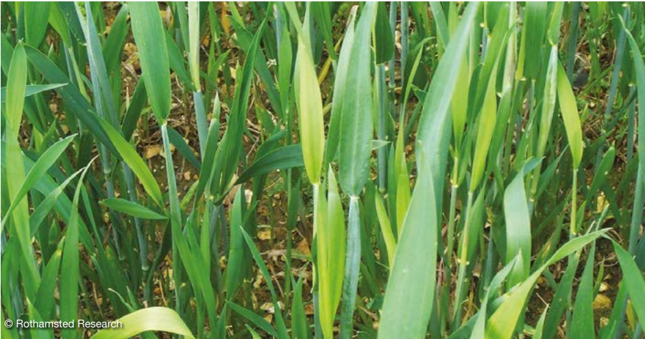
Figure 4.4 The youngest leaves of sulphur-deficient cereals are often yellow

Not all cereal crops will require sulphur, and the responsiveness of a crop to the application of sulphur is dependent on soil texture and winter rainfall.