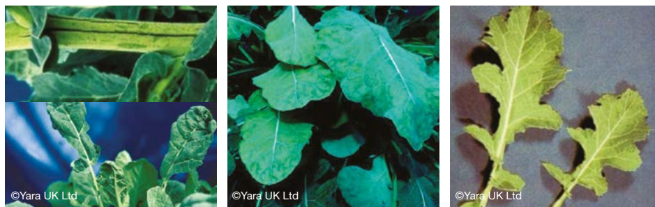
Figure 4.6 Micronutrient deficiency symptoms in oilseed rape: boron, manganese and molybdenum (left to right)

Foliar nutrients can be applied most cost-efficiently by tank-mixing with other crop inputs, such as fungicides, but check product labels carefully for compatibility.