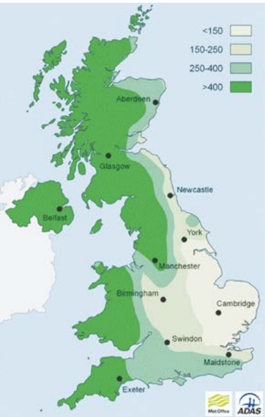
Figure 4.2 Excess winter rainfall (mm)

There are three SNS Index tables representing 'low rainfall' (annual rainfall less than 600 mm, or less than 150 mm excess winter rainfall), 'moderate rainfall' (between 600–700 mm annual rainfall, or 150–250 mm excess winter rainfall), and 'high rainfall' areas (over 700 mm annual rainfall, over 250 mm excess winter rainfall).