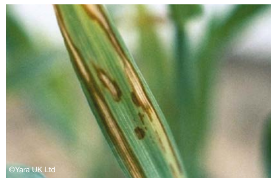
Figure 4.5 Micronutrient deficiency symptoms: copper, manganese and zinc (top to bottom)