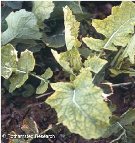
Figure 4.5 The youngest leaves of sulphur-deficient oilseed rape are often yellow

Later, severely sulphur-deficient oilseed rape crops will have pale flowers; however, by this time, it will be too late to correct the deficiency.